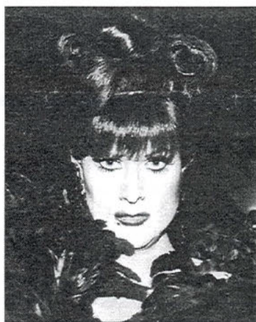
Empress IX Philomena

for what I have achieved, but as a standard to hold up against what I have yet to accomplish," remarked Empress Philomena.