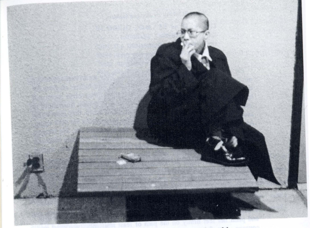
★ "America isn't the blond, blue-eyed world of models anymore," notes Shimizu (at Jean-Paul Gaultier's Paris show last fall).