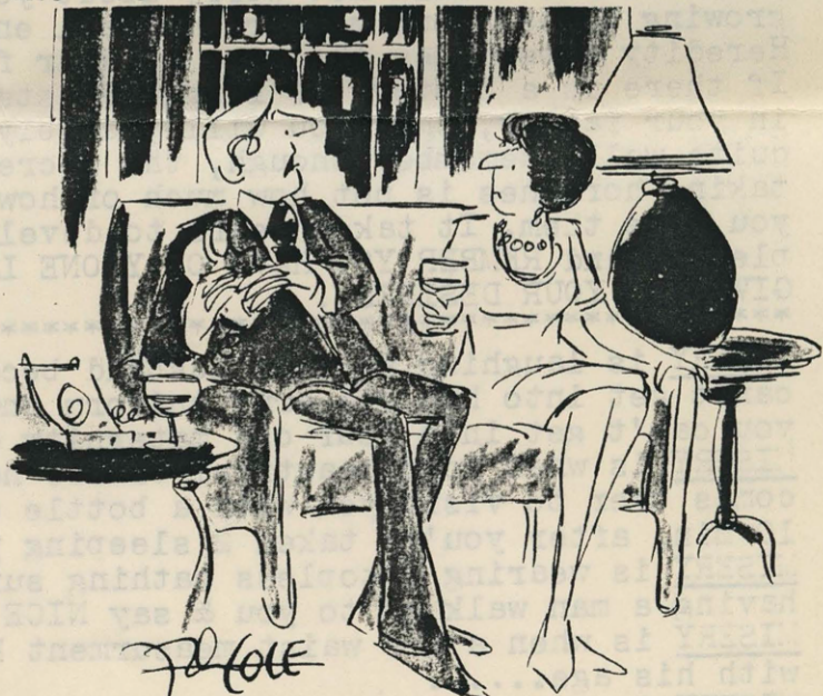
"It's some guy who says his name is Susan."

Like everything else that we do here at TVIC, it is dependent on you, the readers, not just financially but for material too. Each of you has some little idea, comment SO SEND IT IN!!!!!!!!!!!!